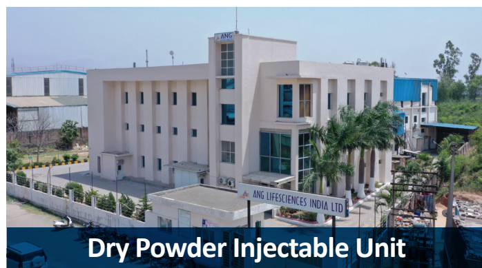
Dry Powder Injectable Unit