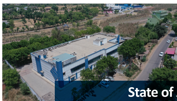
State of Art Plants