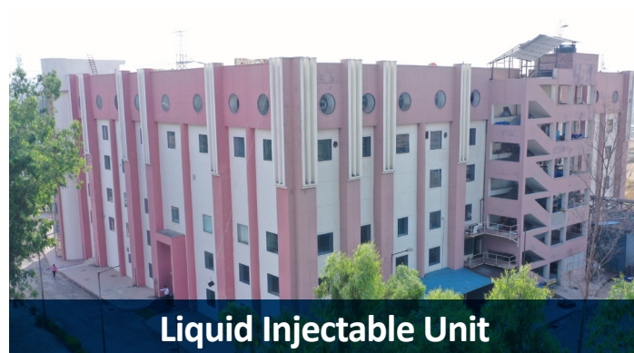
Liquid Injectable Unit